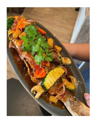
LM17 Pla Rad Prik