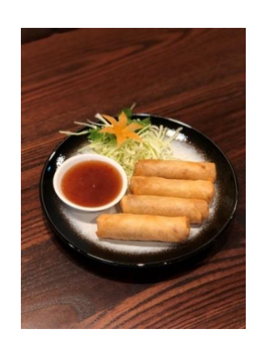
A2. Spring Roll