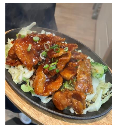
LM14 Moo Ka Ta