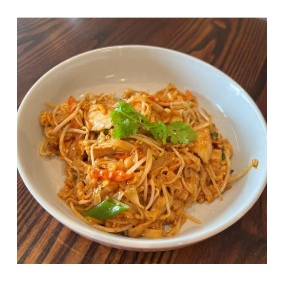
SP1 Pad Thai