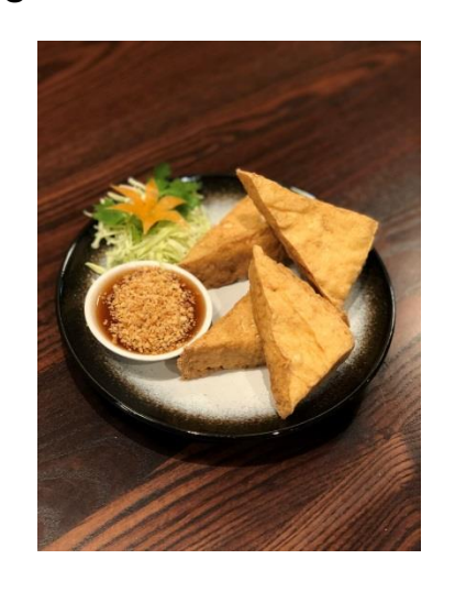
A10. Tow Hu Tod