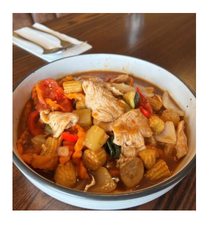
LM11 Pad Priew Warn