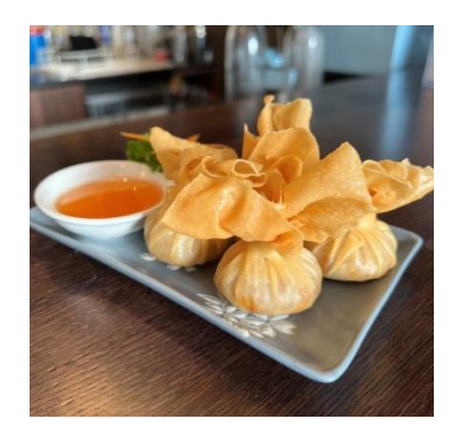
A8. Money Bag