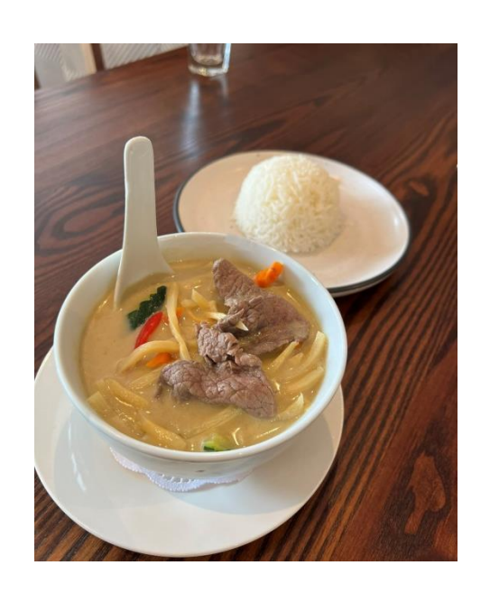
SP3 Gang Kiew Warn