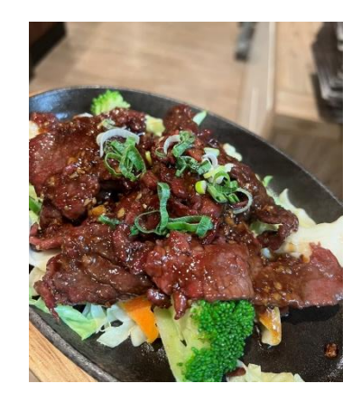
LM13 Ka Ta