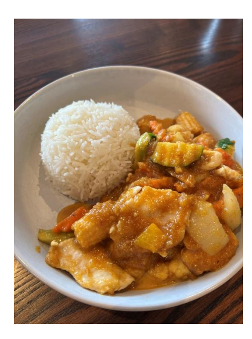
SP5 Pra Ram Long Song