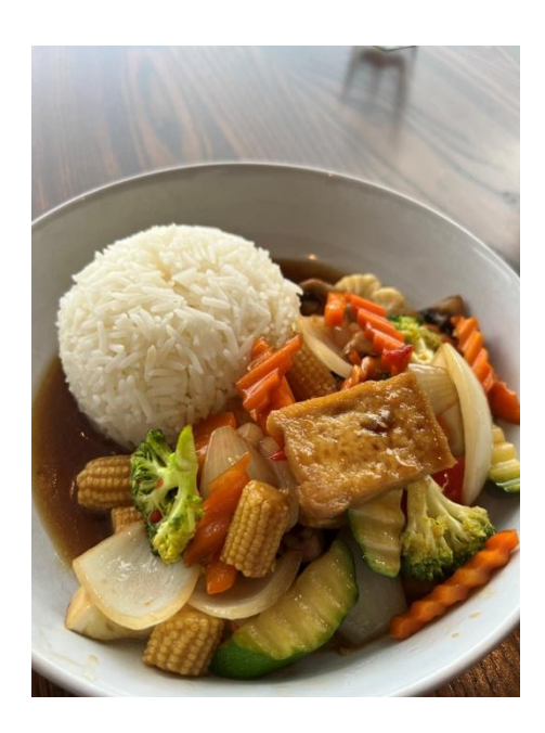
SP8 Pad Puk Jae