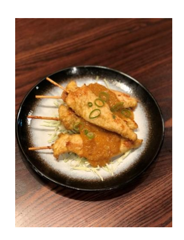
A3. Satay Gai