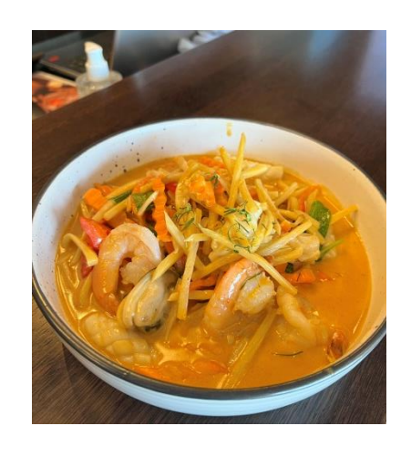
LM15 Pad Talay