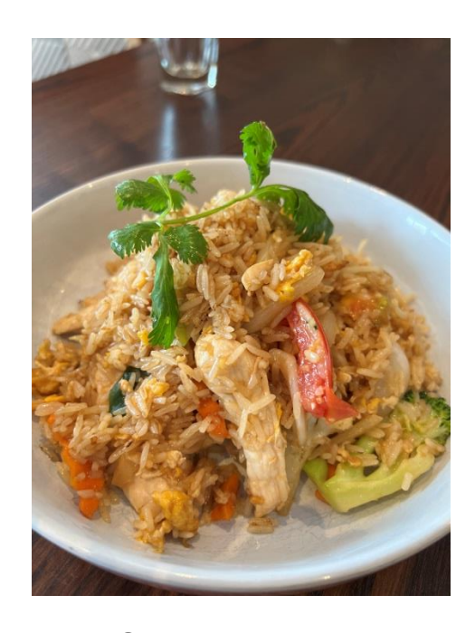
SP2 Khao Pad