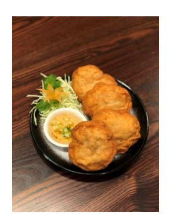
A5. Tod Mun Goong