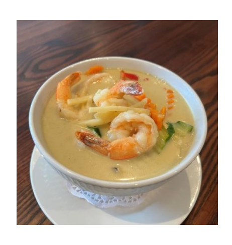
LM5 Gang Kiew Warn