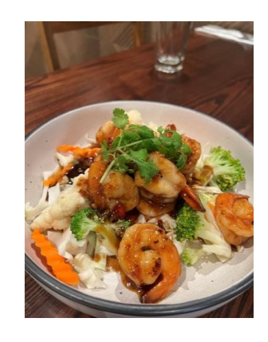
LM16 Tod Kratiem Prik Thai