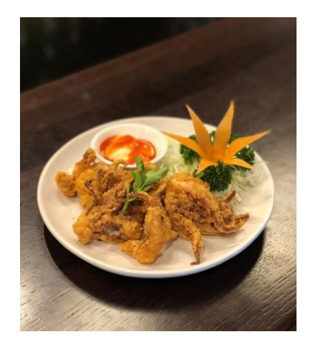
A9. Spiced Crispy Squid