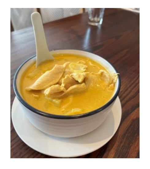
LM4 Gang Gari