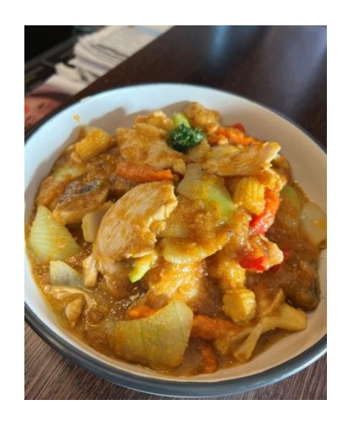
LM8 Pra Ram Long Song