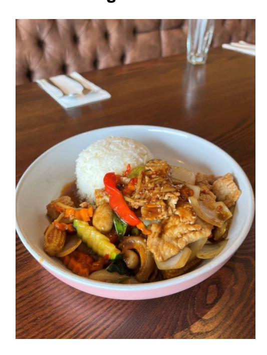
SP6 Pad Khing